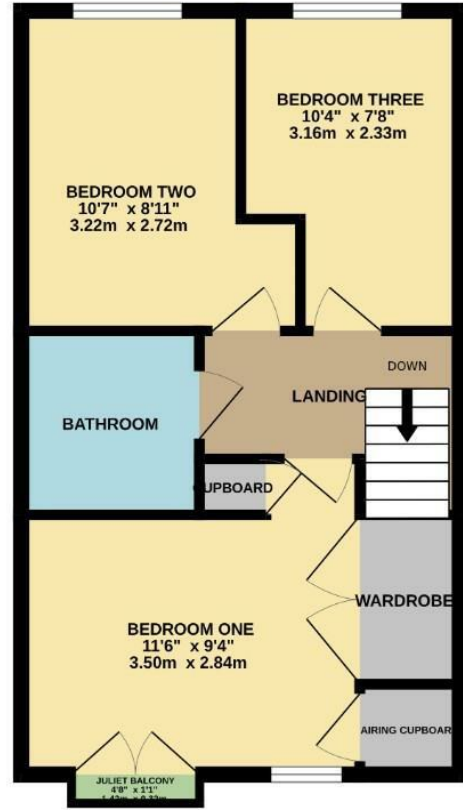
1ST FLOOR 444 sq.ft. (41.2 sq.m.) approx.